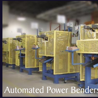
Automated Power Benders