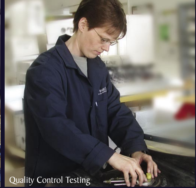
Quality Control Testing